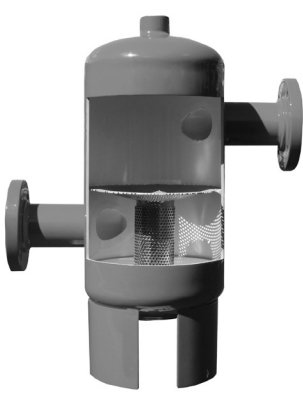
"R" Series with strainer